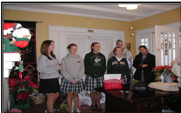
Saint Mary's Academy Student Council