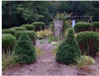
St. John's UMC, grounds rejuvenation